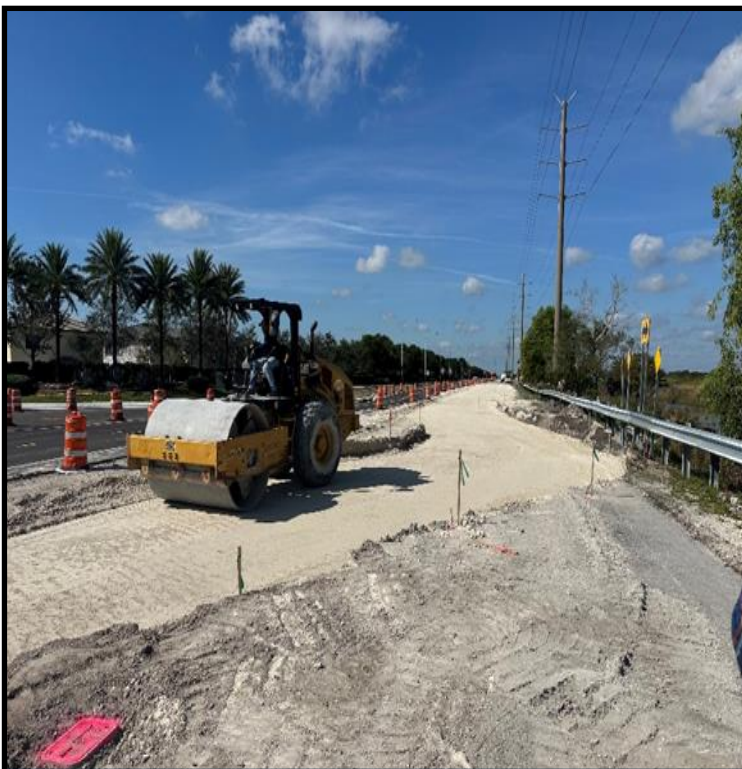
Nob Hill Road Roundabout Installation

Sidewalk Closure: To ensure pedestrian safety, the sidewalk on Loxahatchee Road between North University Drive and Parkside Drive will be closed for sidewalk and handrail construction.